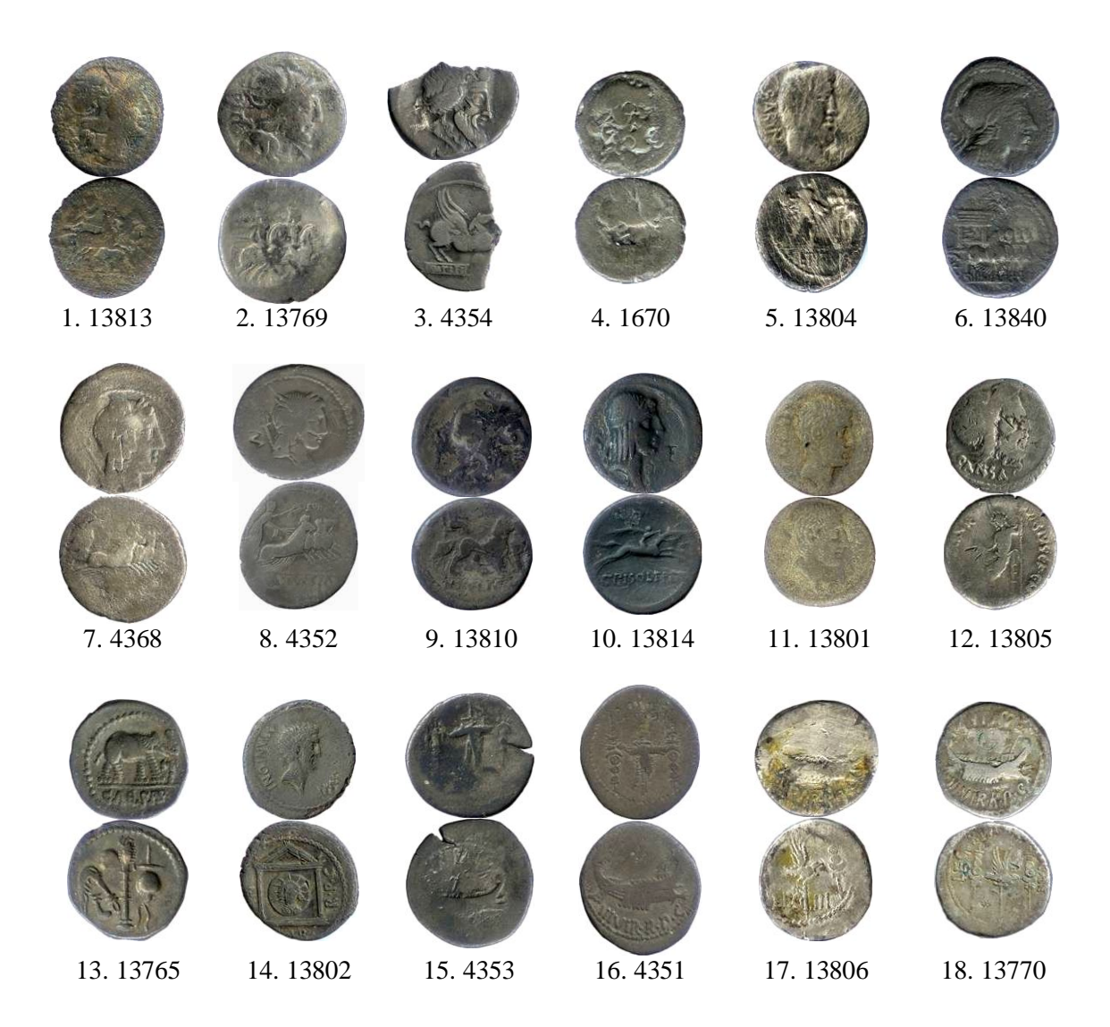
Plate II. Illustrated Catalog of the Roman Republican Coins

Isolated finds of roman republican coins from Buridava, contained in the collection of Vâlcea County Museum